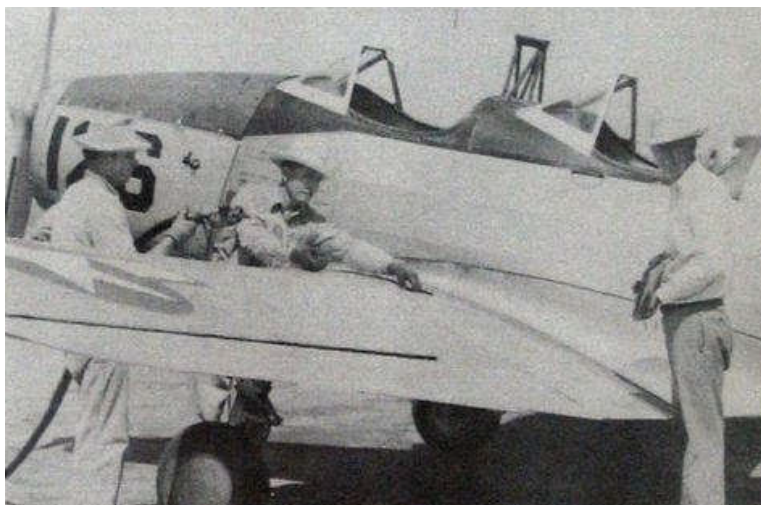
Civilian contractors refuel a PT-19.

Yearbook uses the designation 2566 th AAF Flying Training Detachment